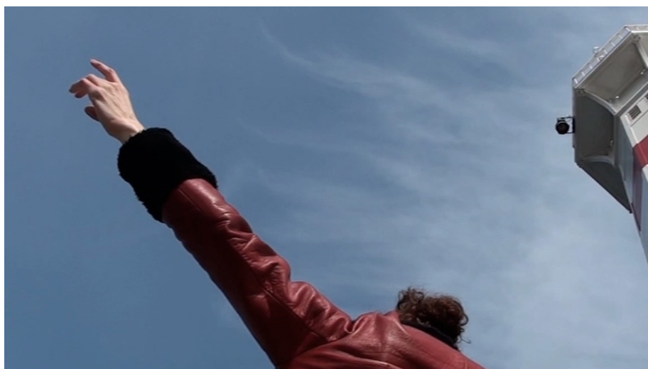
Video still from shoot at the lighthouse in Malmö.

SK: In this particular improvisation I am standing in front of a lighthouse in Malmö. It is sunny and cold. People are passing close by, for this lighthouse is near a drawbridge leading to the ship building yards close to the university and many other buildings. What is the affective window? It is a combination of impulses from inside and outside: I bend my knees and fall over the railing wanting to dissolve into particles at the same time as turn to water on the stones. There are emotional overtones, but the affective state is more than feeling tired or a little anxious or happy to be outside in the air as the seasons change. I can't quite capture it, or seem to slide in and out of different affective currents. There are traces of the social urban environment for the presence of the two observing tourists and the cars, bicycles and trucks passing. Suddenly I am more aware of what is going on outside of me than inside: the tourists begin to stage their own performative shoot, letting themselves become more adventurous in how they use their bodies as they are co-located with us using our bodies in a way that is clearly for a film or art project. Two workers see me slide down the concrete slope to the rocks and water below and ask, partly humourously, partly in earnest, if I need help. The affective state is made up of the emotional, physical, social, environmental and meteorological.